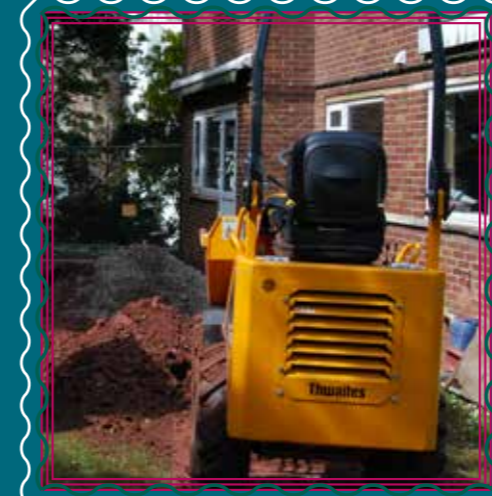
Digging foundations for our Lounge Extension...