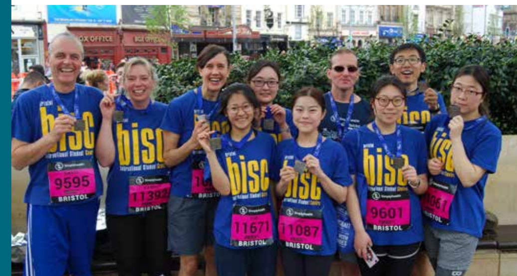
The BISC 10K Team completing the race in May 2017

It has been an exciting time at BISC! As we write the diggers have taken up muddy residence in the back garden, and deep trenches have been dug for the foundations of the ground floor lounge extension. The work will continue over the summer months, reaching completion in time for the September Welcome. It is of course only thanks to you our supporters and friends that this project has been able to get off the ground (literally!). Since the 40th Anniversary Dinner Celebration back in May last year, the 10K Run both years, the Arts & Crafts Evening, the Art Shows and onwards to the present day, we have just been so overwhelmed by the wonderful encouragement and financial support given by our BISC friends. We have now raised just over £83 000 of our £145 000 target . Thank you all for such generosity! This giving will enable the welcome of international students in this place to grow from strength to strength. We also look forward to expanding our core team in the near future, as this is an essential need for operating the centre efficiently. We look forward to advertising for an extra paid position at BISC in October, so watch this space...!!